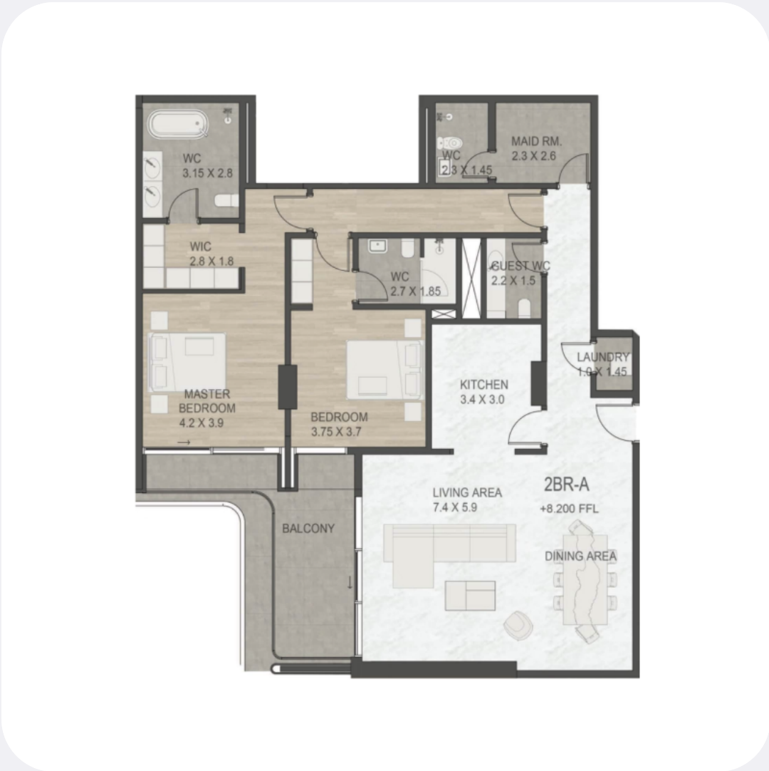
Apartments 2 bedroom

FROM EUR 2,838,050 TO No info 3398 sqft / 316 m 2