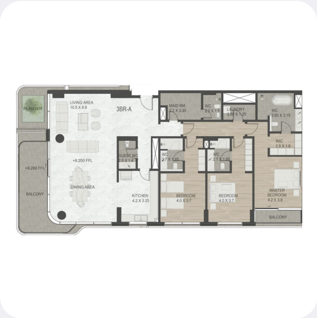
Apartments 3 bedroom

FROM EUR 2,838,050 TO No info 3398 sqft / 316 m 2