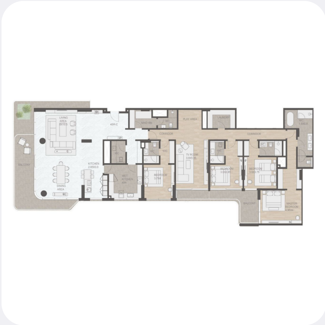
Apartments 4 bedroom

FROM No info TO No info 1829 sqft / 170 m 2 1829 sqft / 170 m 2